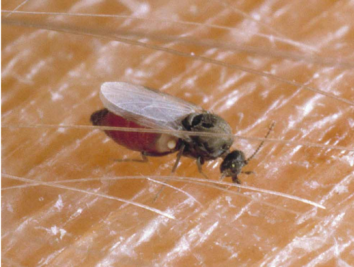
Figure 1. No-see'um ( Culicoides ).

Adult no-see'um activity is associated with air movement. Subsequently, little feeding occurs in the presence of a slight breeze. No-see'ums are also sensitive to temperature. Animals with a high body temperature are most attractive to great numbers of female no-see'ums. In addition, persons performing hard labor outdoors are frequently severely annoyed by these insects.