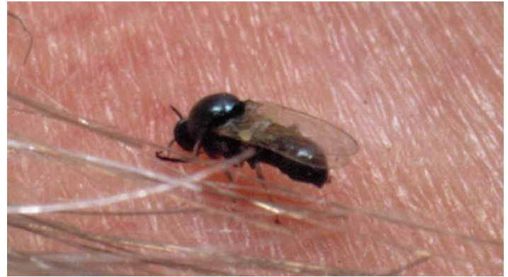
Figure 2. Black fly on man.

The stable fly (Figure 3), also known as the dog fly, is a blood-sucking pest that closely resembles the house fly. It is similar to the house fly in size and color, but is easily