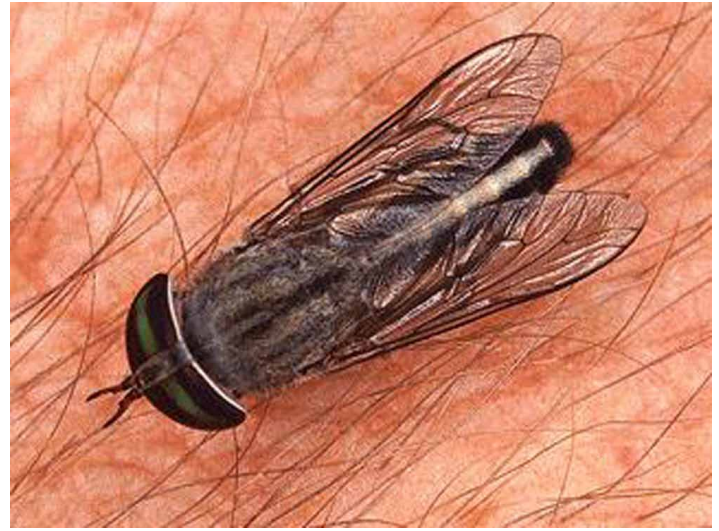
Figure 4. Horse fly.